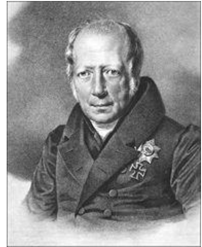
Wilhelm von Humboldt (1767-1835)