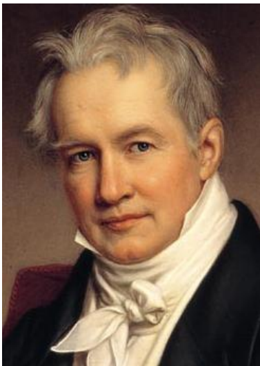
Alexander von Humboldt (1769-1859)

Alexander and Wilhelm von Humboldt were brothers, born in, respectively, Berlin and Potsdam in the second half of the 18th century, the age of Enlightenment and the French Revolution in Europe. It was also an incredibly creative era, inspiring many important German novelists, and philosophers, such as Goethe, Schiller, Heine, Herder, Kant, Fichte, but also musicians such as Beethoven, Schubert, Haydn, not to mention scientists, such as Gauss, Fraunhofer, Herschel, Lichtenberg, Ohm, and others. Whereas Alexander became a natural scientist, geographer and explorer, his brother Wilhelm worked as a philosopher, linguist and Scientist of education. Both together formed the Prussian concept of a humanistic and holistic education and science system, combining both humanities and natural sciences. From our perspective today, both can be considered to have been universal scholars, with Alexander focusing more on natural sciences and Wilhelm on humanities