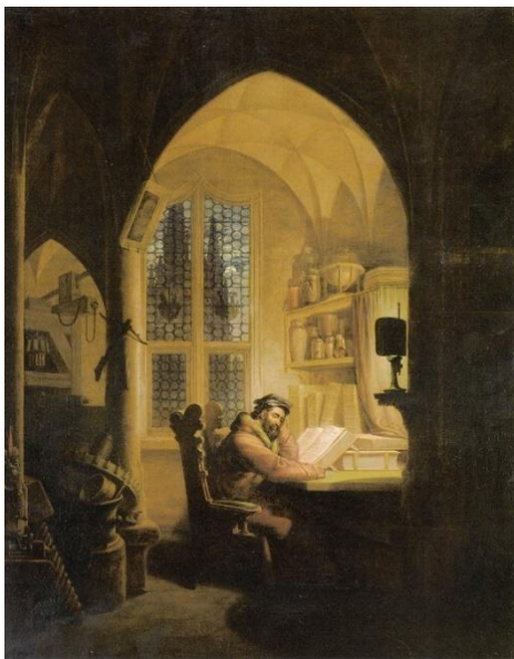
Faust in the study room (Georg Kersting, 1892)

To accomplish Dr. Faust's greatest wish and the dream of every scientist in achieving the highest level of wisdom, it is instructive to quote from Goethe's famous novel Faust: Eine Tragödie [3]: "Das ich erkenne, was die Welt im Innersten zusammenhaelt", ("So that I may perceive whatever holds the world together in its inmost folds"). This lofty goal requires moving beyond market-oriented education and knowledge, and advancing the capability to recognize and fully utilize the coherence in natural sciences, humanities and art. The returning to the Humboldtian humanistic ideal in education and science combined with the new technical means of the 21st century would give the students and scientists worldwide the chance for universal and independent education and research that holds a humanistic approach to generating knowledge beyond the pressures of the commercial world.