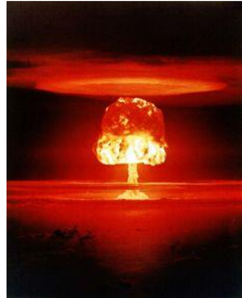
Operation Castle thermonuclear test, Castle Romeo shot

From my own experience as a scientist working in the field of information science in Potsdam and Kyoto, I think a contemporary humanistic and ethics-driven Humboldtian approach should also contain substantial education about recent and modern history. This knowledge is necessary for a comprehensive impact assessment of science and research activities for society and beyond, e.g. in nuclear sciences, but also technological developments, e.g. artificial intelligence and autonomous systems. Beside the admission that funding agencies can determine the science and research agenda, the following example illustrates the dependence of science and research on particular interests. Scientific work at universities and institutions is mainly judged by publications. The rating of the work and the scientist increases with the ranking of the journal in the Science Citation Index. A study at the University of Montreal shows [2] that the sector of research publishing is now dominated by just five publishing houses. This means, among other things, that these publishers can wield power and influence on education and research facilities, such as universities, but also on the very topics science and research topics. This contradicts the Humboldtian ideal of academic freedom and self-determination.