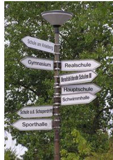
Signs of different school types and gyms on a school campus in Germany