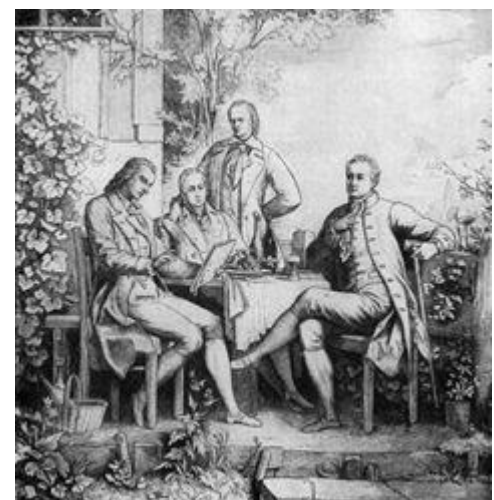
Schiller, Wilhelm and Alexander von Humboldt as well as Goethe in Jena