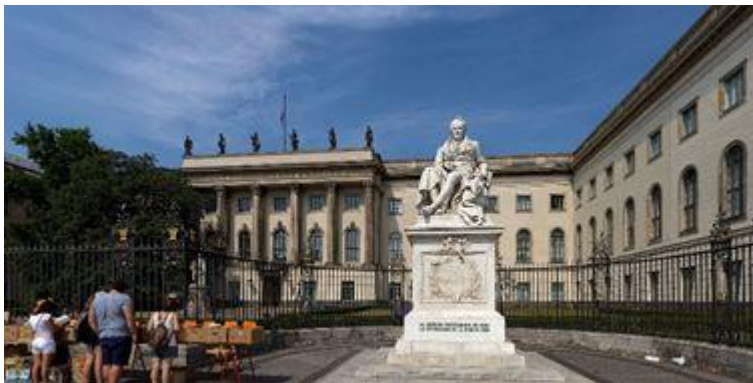
The Humboldt University of Berlin is the first modern university in the world

knowledge. The Humboldt University of Berlin, founded under the influence of Wilhelm von Humboldt in 1810, and acting according to his precepts, later became the center of science and research, not only in Germany but all of Europe and beyond. In that spirit, almost 30 Nobel Prize winners in physics, chemistry, medicine and literature have been former students of this university in the 20th century, especially before World War II.